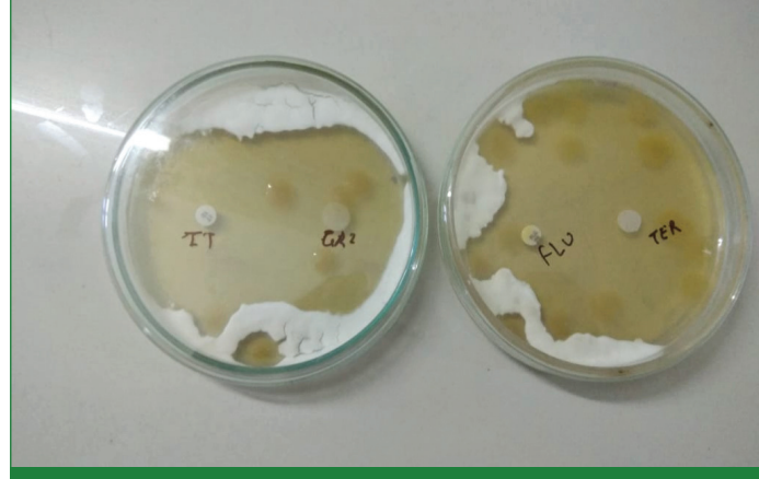
[Table/Fig-3]: Antifungal Susceptibility Testing (AFST) by disk diffusion method (for all the four drugs).

Commercially available disks 9 mm diameter preloaded with fluconazole 25 µg and itranconazole 10 µg were used (HI MEDIA, India). Disks containing griseofulvin 10 \mu g and terbinafine 2 \mu g were not commercially available and were prepared in the laboratory. For these two antifungal, the drugs terbinafine and griseofulvin (synergene active ingredients) were obtained in powder form. A stock solution of each drug was prepared using DMSO as follow: terbinafine 0.1 mg/mL and griseofulvin 1.25 mg/mL. Blank paper disks of Whatmann filter paper (Number 1, 6 mm and 9 mm diameter were loaded with 20 µL of the prepared stock solution to obtain the desired drug concentration per disks 2 \mu g and 10 \mu g for terbinafine and griseofulvin, respectively. Two plates of Muller hinton agar were used for sensitivity testing. A 0.5 Mcfarland turbidity dilution of every isolated strain was made and inoculated on Muller hinton agar plate by lawn culture method. On one plate the disks of terbinafine and Itraconazole were applied while on other plate the disks of fluconazole and griseofulvin were applied. Plates were inverted and incubated at 28°C upto seven days [Table/Fig-3]. Inhibition Zone Diameters (IZD) were measured in millimetres. The standard zone diameter of every antifungal agent is shown in the [Table/Fig-4].